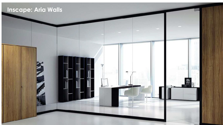
Inscape: Aria Walls

Architectural Walls + Open Systems + Private Offices + Filing & Seating 2635 University Ave. West. Suite #120, St. Paul, MN 55114